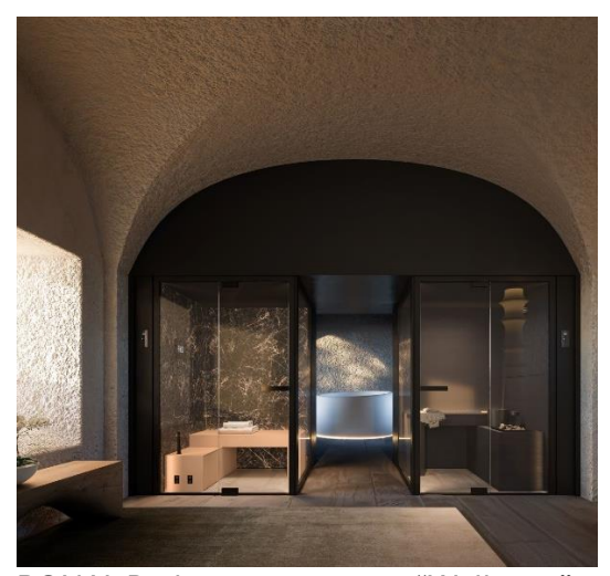
RONAL Bathrooms concept "Wellness"

The special highlight of the wellness space is the single-piece freestanding wellness bathtub NAMI, characterized by its unique shape and an emotional perimeter light on the bottom. This bathtub or even mini-pool has been created exclusively for the Salone Del Mobile.